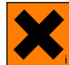
Xi - Irritant