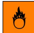
O - Oxidizing